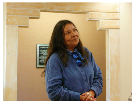
Leslie Marmon Silko in the Labriola Center

The previous Simon Ortiz and Labriola Center lectures delivered