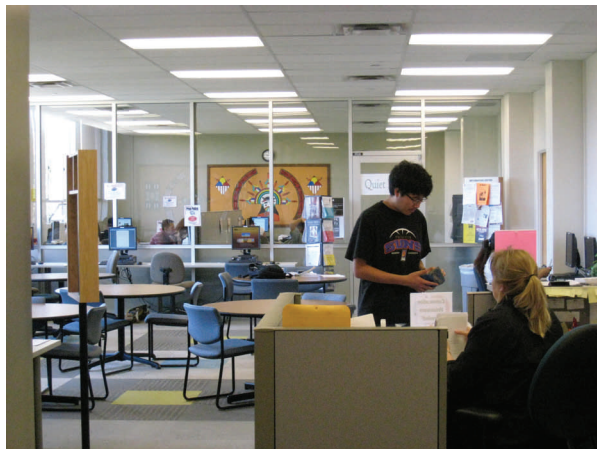
American Indian Student Support Services

While offering my assistance at AISSS, it was great to make connections with some of the students which prompted them to visit the