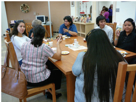
Open House attendees

ing photographs of American Indian faculty at ASU and a sampling of their publications.