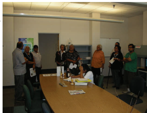
American Indian Programs conference room

Sherman Institute in Riverside, California, World War military exploits, community activities, speaking to his grandchildren, and children's stories. Transcripts are available for tapes 1-4. The call number is LAB