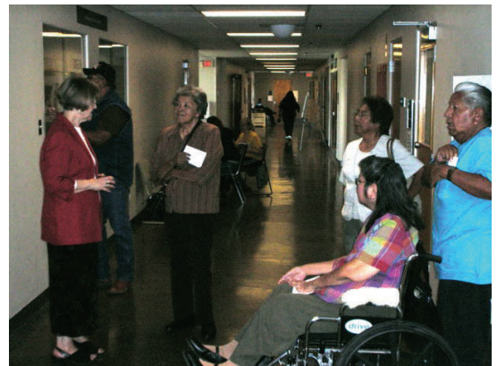
Gila River Elders tour