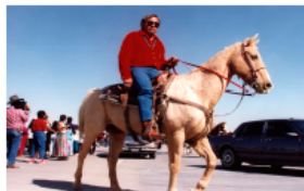
Peterson Zah Collection L&B 1455-154 Folios 64, 7/1

An endowed library and manuscript collection dedicated in 1993, the Labriola Center collects current and historical information to support the American Indian curriculum at Arizona State University.