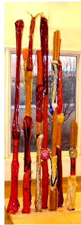
Rosemary Lonewolf's pottery and glass fence

Manuscripts: The Labriola Center holds 80 audio cassettes and 55 reel to reel audio