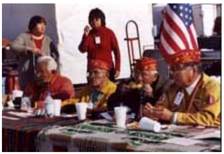
LAB FILM S104:594

Navajo code talkers and the Hopi Piestewa family were special and honored guests.