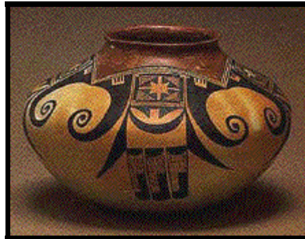
Black and Red on Yellow