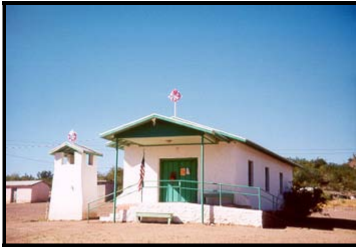
LAB FILM S104:155

Patricia Etter researched the history and re-photographed the churches and schools, which show change over time and reflect continued use.