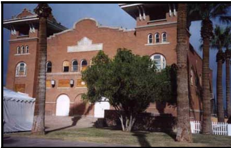
LAB FILM S104:407 Memorial Hall, front view

The grounds had been the site of the Phoenix Indian School since 1891. The school was a co-educational, federal institution for American primary and secondary students.