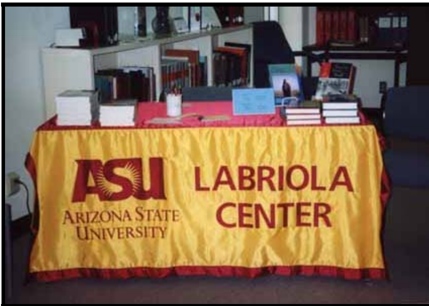
LAB FILM S104:422

Two books were available: Diné: A History of the Navajos and For Our Navajo People: Letters, Speeches, and Petitions, 1900-1960 (University of New Mexico Press, 2002).