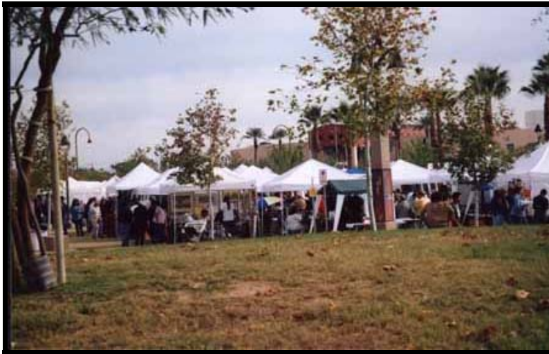
LAB FILM S104:404

For 26 years now, the Pueblo Grande Museum Auxiliary, has sponsored an Indian Market that draws thousands to purchase the art and crafts of some 500 Native artisan from around the country.