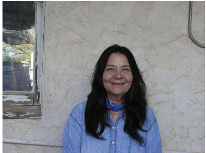
Leslie Marmon Silko

Silko has won prizes, fellowships, and grants from such sources as the National Endowment for the Arts and The Boston Globe. She was the youngest writer to be included in The Norton Anthology of Women's