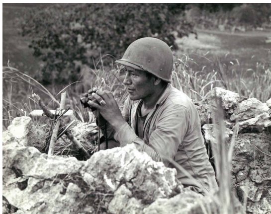
Carl Gorman on Saipan 1944

The largest, most comprehensive exhibition on the Navajo Code Talkers of World War II will be on display at the Labriola National American Indian Data Center from October 19 th to November 13 th , 2009.