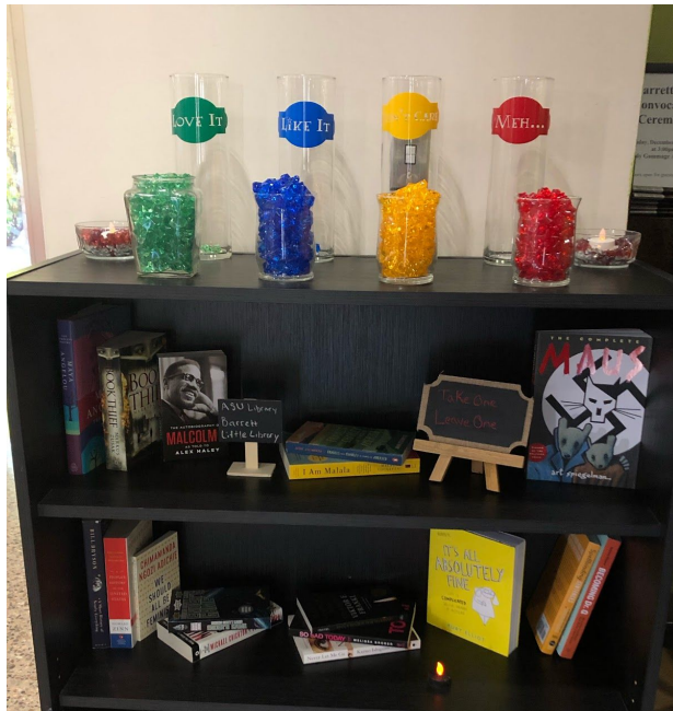
Photo of book display at Barrett Honors College